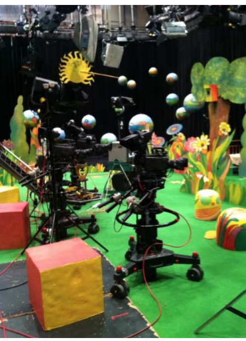
Studio at Czech television