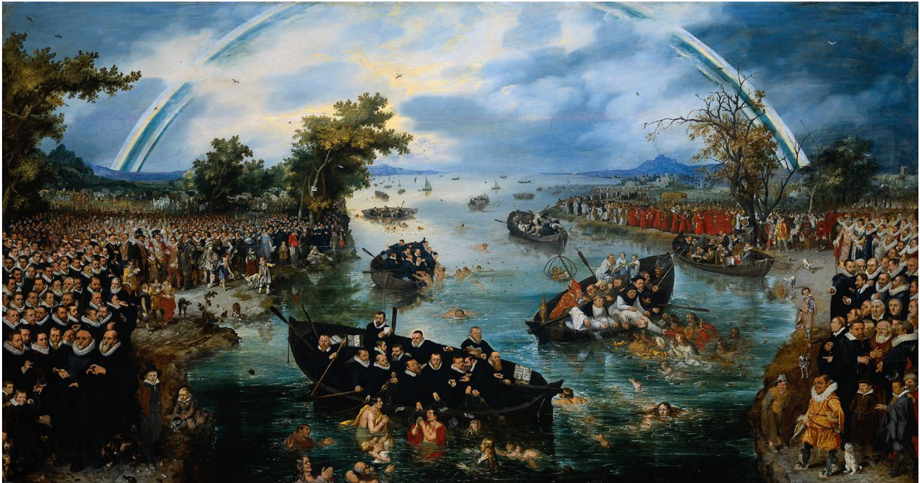
Adriaen Pietersz van de Venne (1589-1652)