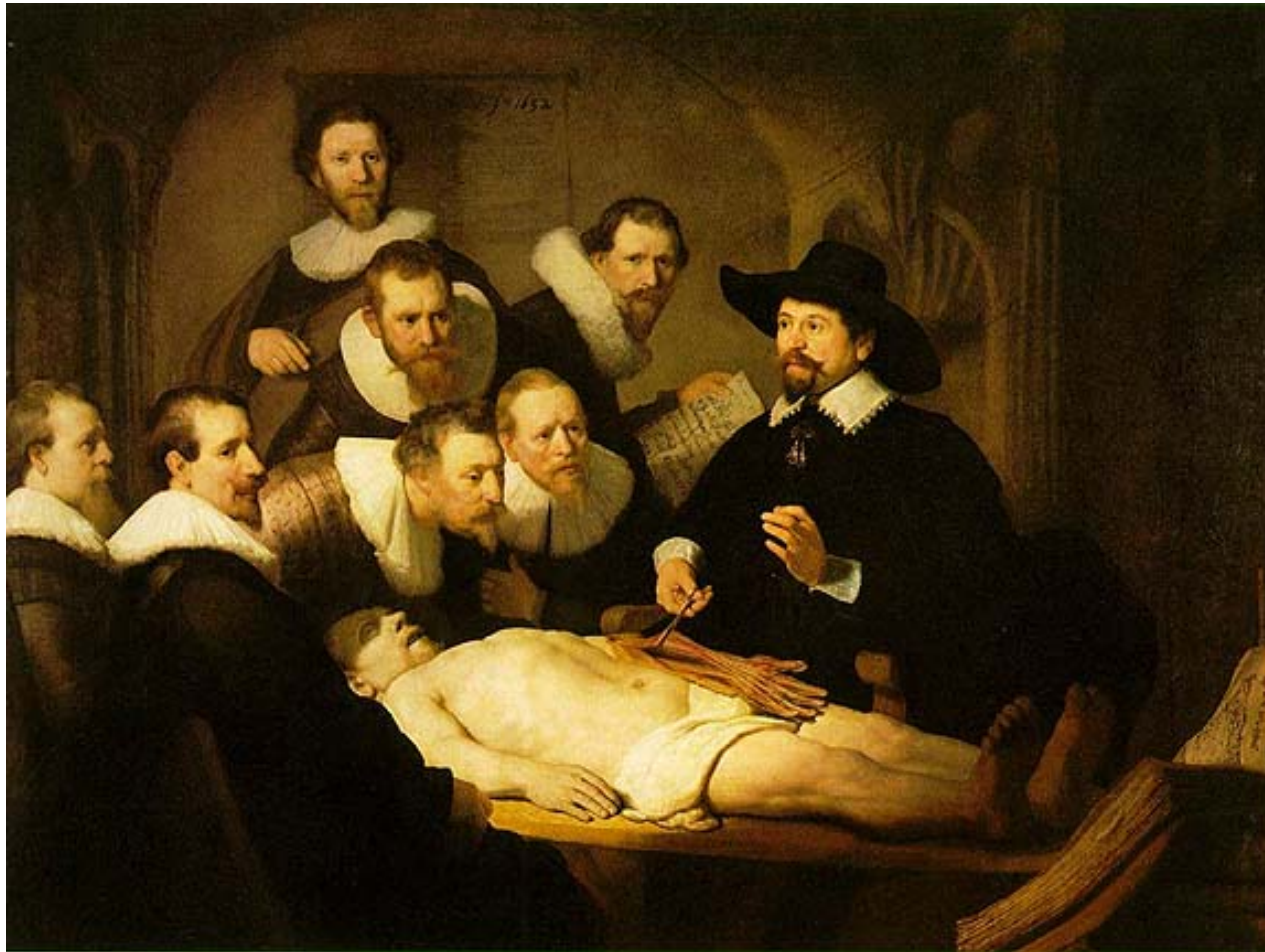
Rembrandt (1606 – 1669)