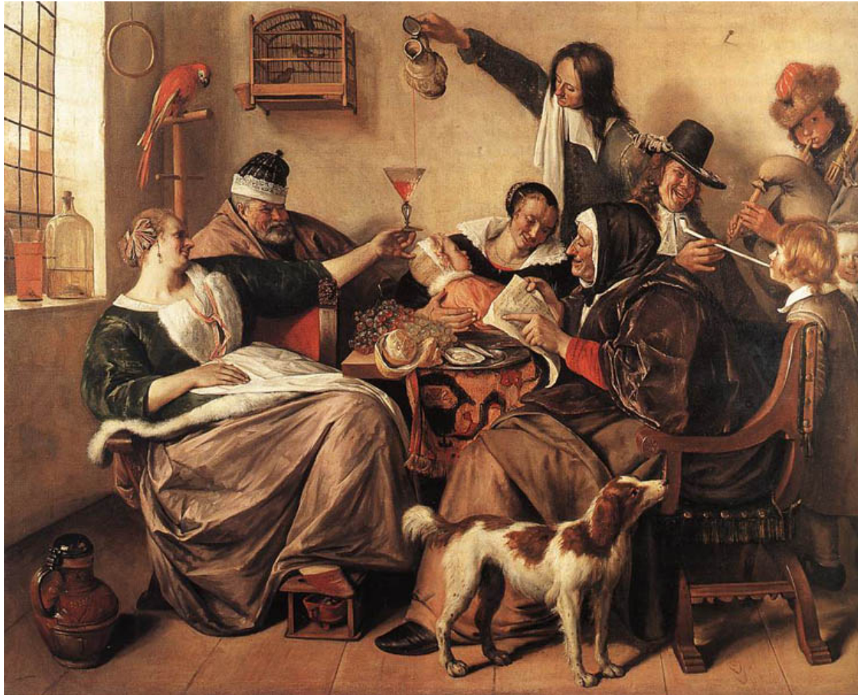
Jan Steen (1626 – 1679)